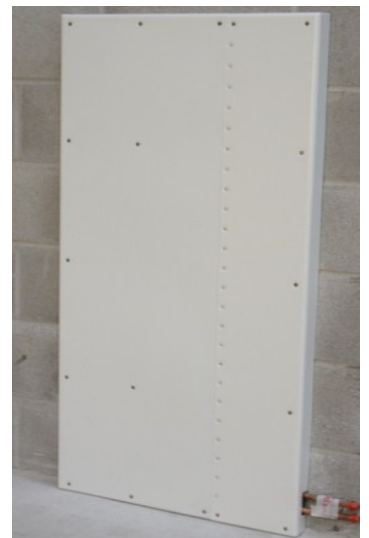
Above, wall mounted NOMS panel before being repeatedly beaten with a four foot long scaffolding pole.