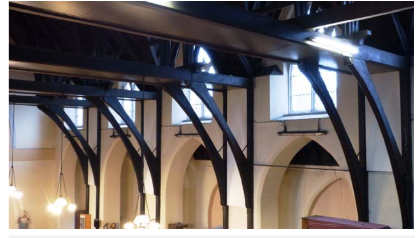
Above Free hanging between the beams at St Silas Church, North London Below Angle mounted wall panels at Sacred Heart Church, North London